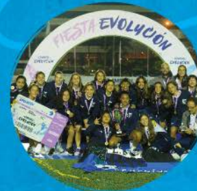
Sub-14 - Fem. Liverpool (URU)