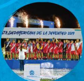
Sub-16 - Fem. Liga del Valle (COL)