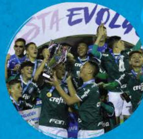
Sub-13 - Male Palmeiras (BRA)