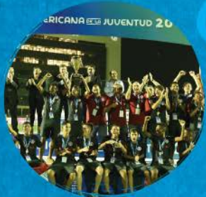
Sub-13 Male Clube Internacional de Porto Alegre (BRA)