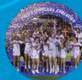
Sub-16 - Fem. São Paulo (BRA)