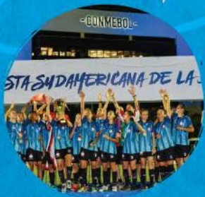
Sub-14 - Fem. Centro Olímpico (BRA)