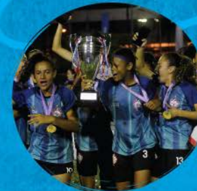
Sub-14 - Fem. Centro Olímpico (BRA)