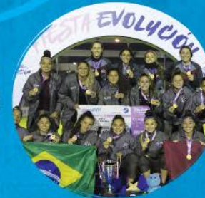
Sub-16 - Fem. Ferroviária (BRA)