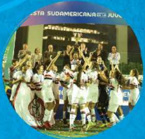
Sub-16 - Fem. São Paulo (BRA)