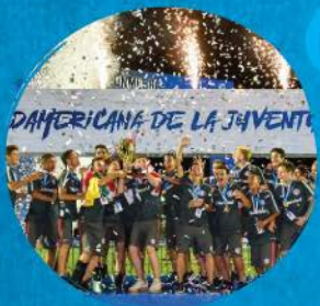
Sub-13 - Male Clube Internacional de Porto Alegre (BRA)