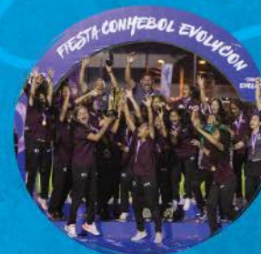
Sub-14 - Fem. Ferroviária SAF (BRA)