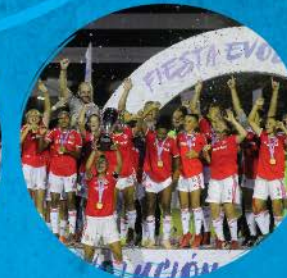
Sub-16 - Fem. Clube Internacional de Porto Alegre (BRA)