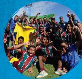
Sub-13 - Male Fluminense (BRA)