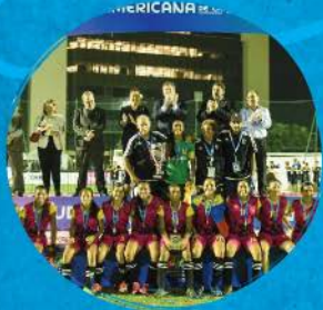
Sub-14 - Fem. Santander (COL)