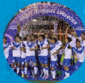
Sub-13 - Male Vélez Sarsfield (ARG)